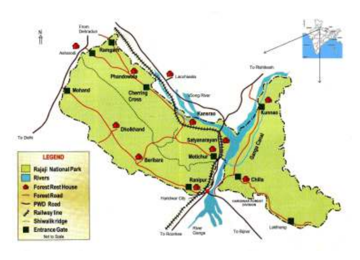
Figure 1 - Location map of the Rajaji national Park

Rajaji National Park (RNP) is located in north-west India at 29°15′-30°31′ N 77°52′-78°22′ E, falls under the Gangetic plains biogeographic zone and upper Gangetic plains province (Fig. 1). Maximum portion of the park lies under Shivalik's biogeographic sub-division. RNP was established in 1983 with the aim of maintaining a viable Asian elephant ( Elephas maximus ) population and is designated a reserved area for "Project Elephant" by the Ministry of Environment, Forest & Climate Change, Government of India. The total size of the park is 820.21 km<sup>2</sup>. The dominant vegetation of the area comprises Sal Shorea robusta, Kamala Mallotus phillipinensis, Cutch Acacia catechu, Kadam Adina cordifolia, Bahera Terminalia bellirica, Indian Banayan Ficus bengalensis and Indian Rosewood Dalbergia sissoo. The dominant fauna of the park consists of tiger Panthera tigris, leopard Panthera pardus, Himalayan black bear Ursus thibetanus, sloth bear Melursus ursinus, Striped Hyaena Hyaena hyaena, barking deer Muntiacus muntjak, goral Nemorhaedus goral, spotted deer Axis axis, sambar Cervus unicolor and wild boar Sus scrofa, and among reptiles the mugger crocodile Crocodylus palustris and king cobra Ophiophagus hannah. Haridwar Forest Division (HFD) is located adjacent to the RNP (in the north) at 29°58′6.02″ N, 78°13′9.82″ E and well connected with the Lansdowne Forest Division. The dominant fauna in HFD is the same as in RNP.